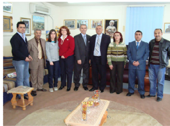
Hawler Typical School

One of 4 schools in the capital of Erbil that teaches in English. This photo is taken in the headmaster's office. This where the Pen Pal program has taken root and where we are outfitting a "Canadian room" as the Germans have done. They have asked for English text books and educational books as their weight is cost prohibitive to ship and are a purely luxury item.